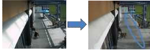
Fig.1. Eigenspace method could not reflect sharp shadow edges.

eigenspace method. For the gradual changing of sharp shadow edges, however, it is difficult to generate the background by linear sum, so that keeping lighting conditions like sharp shadow edge is difficult (Fig.1).